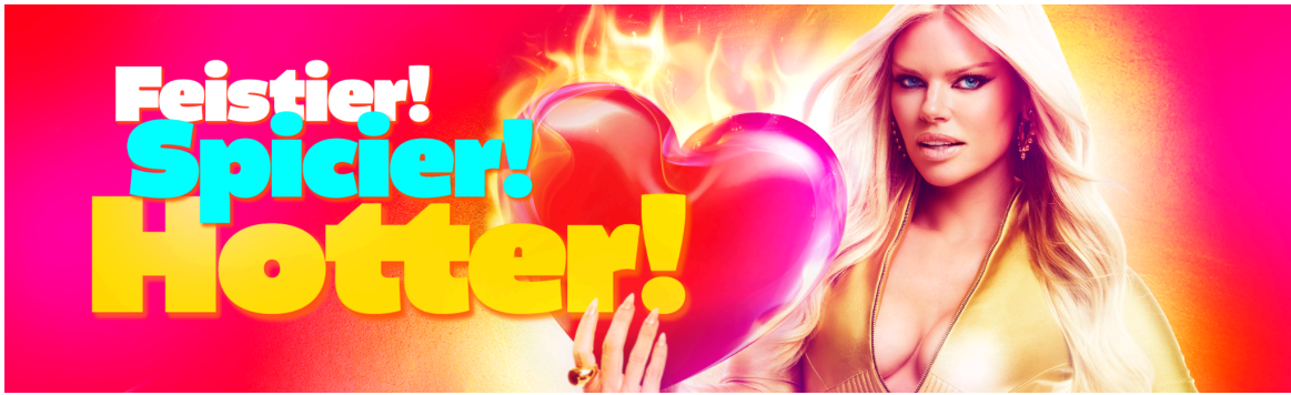
SOPHIE MONK HOST