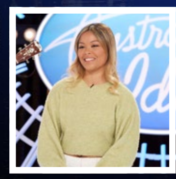
Erica Padilla 21, Victoria TikTok star with 1.3 million followers.